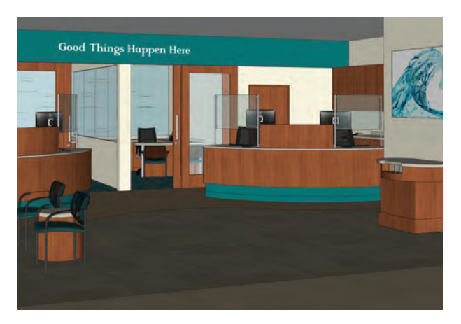
New full-service Gather in-store branch office opens in Līhu'e Walmart in April 2022.

At Gather FCU, we're always working to improve the experience of our members, including products and services, hours of operation, security and technology, staff and branch office locations.